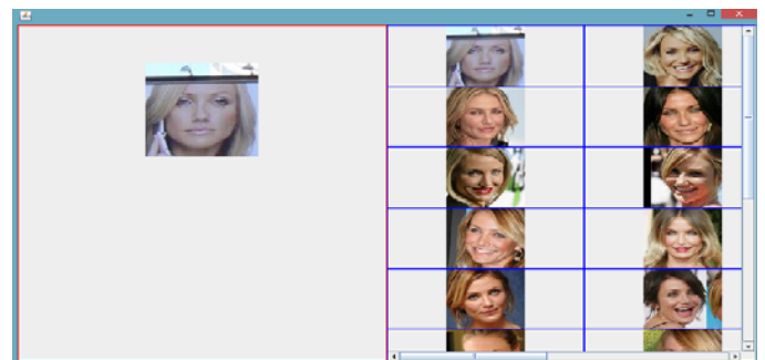
Fig. 2. Generated result of Proposed System

To evaluate performance of proposed system we checked accuracy of proposed system with existing system. We tested our result on various query images against dataset images. Fig. 2 shows result generated from proposed system. Experimental result shows, proposed system having more accuracy as compared to existing system as shown in fig 3.